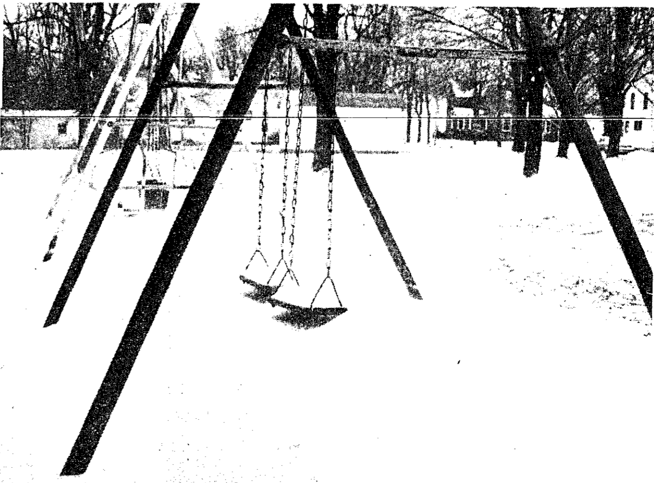
NO SWING -- The heavy snow of late makes it seem like a long time before children will be able to use these swings again. Winter officially began Dec. 21. The first day of spring is March 20.

posed remodeling of the jail to make use of the space in the no-longer-to-be-used sheriff's apartment, but no decisions were made.