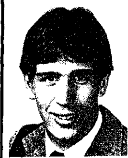
By Mike Score Tuscola County Extension Agricultural Agent

In the 1981 corn report, there is a section comparing yields of crops under conservation and conventional tillage systems.