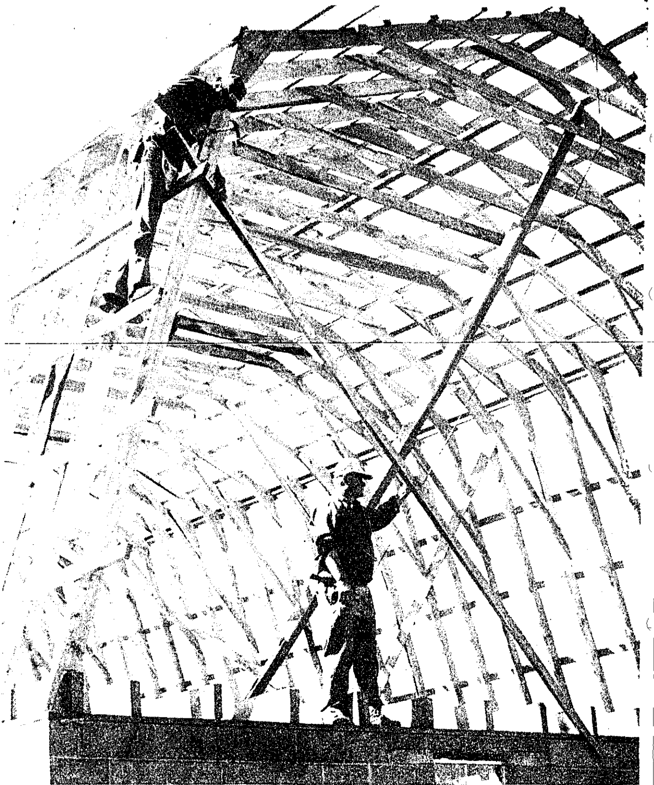
WOOD WORK -- Nailing on a temporary brace, high up on the rafters, is Roy Tuckey. Holding it is Lawrence Smith. The barn of Laurence and Helen Bartle measures 36-by-60 feet. It is located on M-81, east of Cass City.

The only damage was some tarpaper on the roof which melted from the heat.