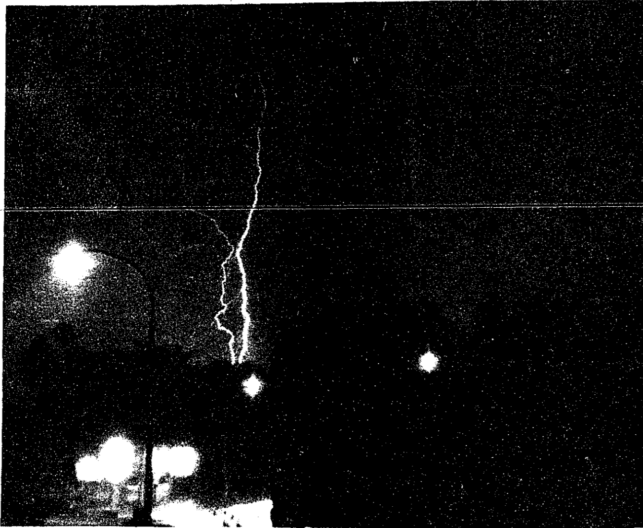
ATMOSPHERIC ELECTRICITY -- Lightning strikes east of Cass City Sunday night during the storm that brought torrents of rain and brief power outages to the area.