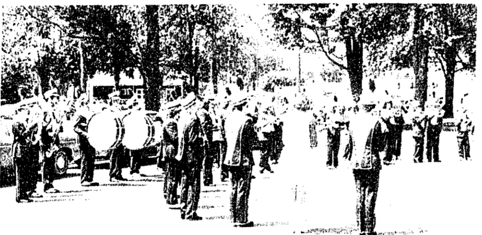
STRIKE UP THE BAND —The Owendale-Gagetown High School band performed a concert in front of the high school at noon Saturday as part of the Owendale celebration.