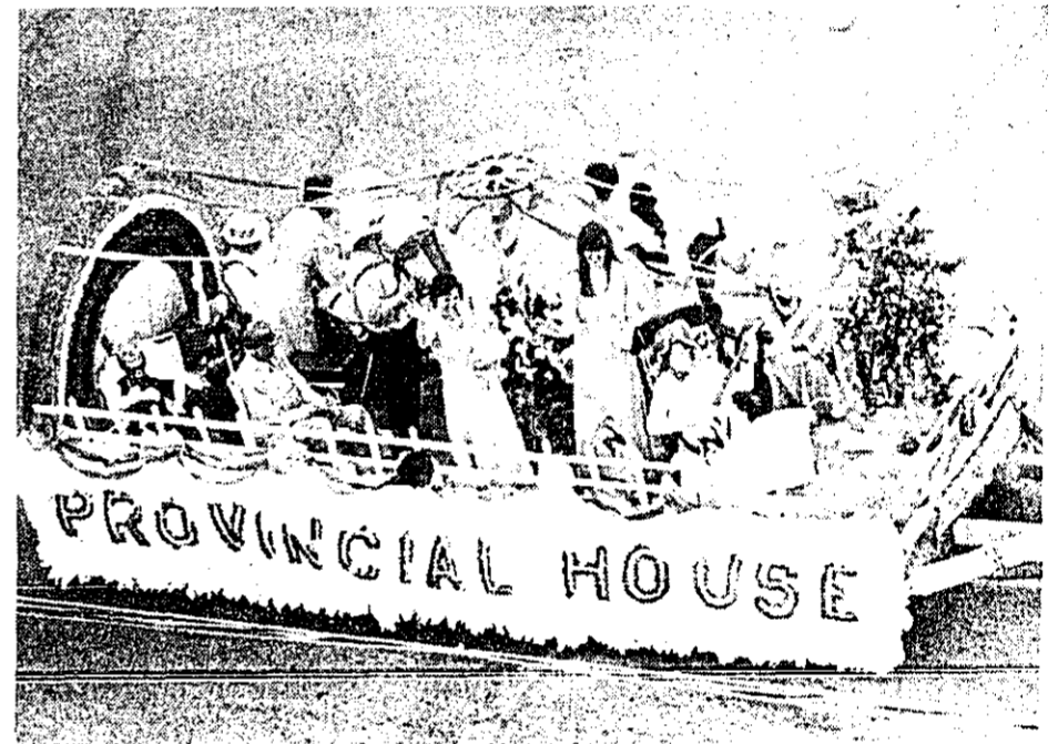
PROVINCIAL HOUSE won a first place trophy for the second year in a row. Its float was tops in the miscellaneous category, followed by Deford Cub Scout Pack #3593, second, and Bay City St. Patrick's, third.