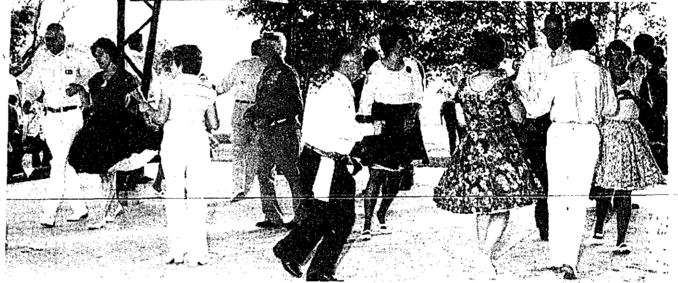
SWING YOUR PARTNERS —Square dancers obviously had a swinging good time. The Rocking Eights Square Dance Club of Caro sponsored the event Friday evening for veterans and beginners.