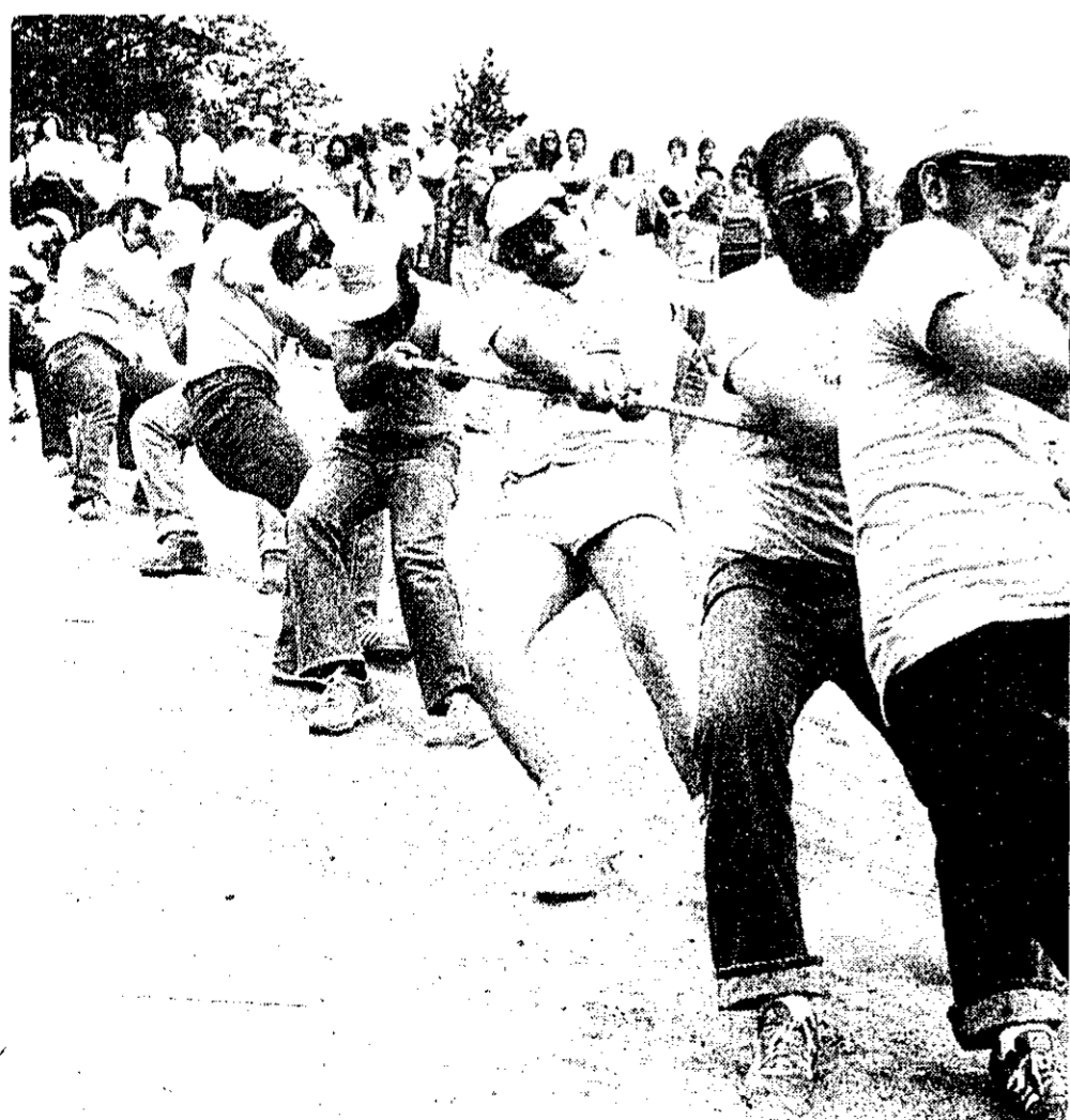
HEAVE, HO —Members of the Ridge Runners team of Sebewaing exhibited various facial expressions and styles during their pull, against Miller Thrillers at Cass City Friday. Their final expressions weren't smiles as the defending champs lost to the Thrillers twice.