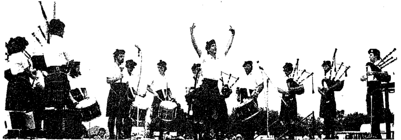
THE FLINT SCOTTISH BAND performed in front of the grandstand after marching in the July 4th parade in Cass City.