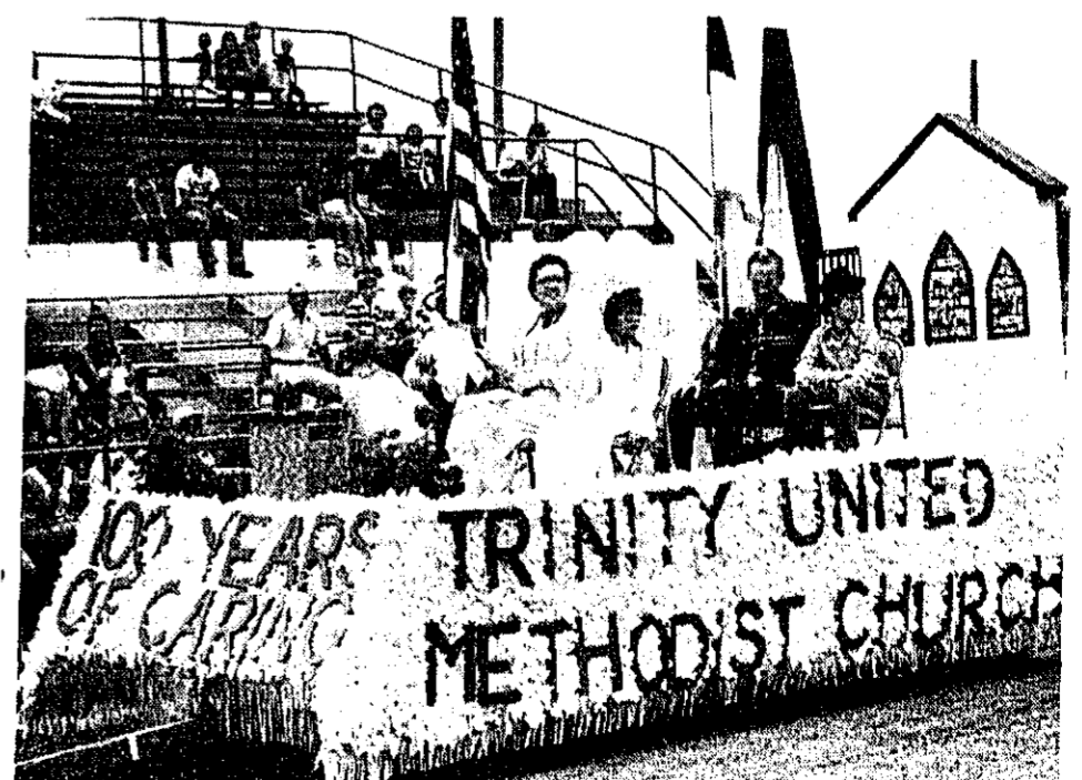
TOPS IN CHURCHES - The Cass City Trinity United Methodist Church float was judged best in the church division in the Fourth of July parade. Its theme of "100 years of caring" celebrated the centennial of its church building this year. Second was the float of the First Presbyterian Church and third, Novesta Church of Christ.