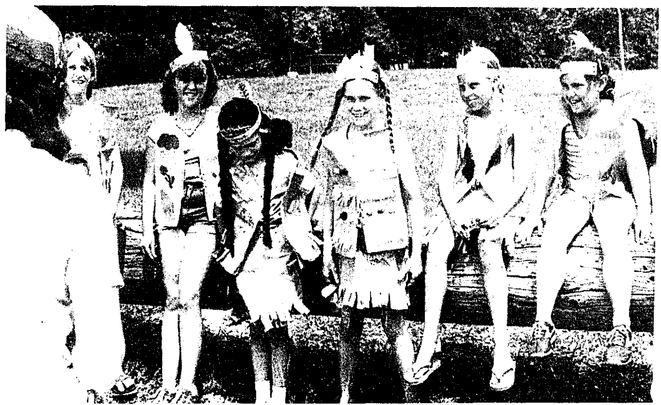
MINNEHAHA has some competition as the most beautiful Indian maiden around. These girls were dressed in the costumes they made as part of Indian Day, sponsored by the summer recreation program. Approximately 21 kids made costumes and displays last Wednesday at the arts and crafts building.