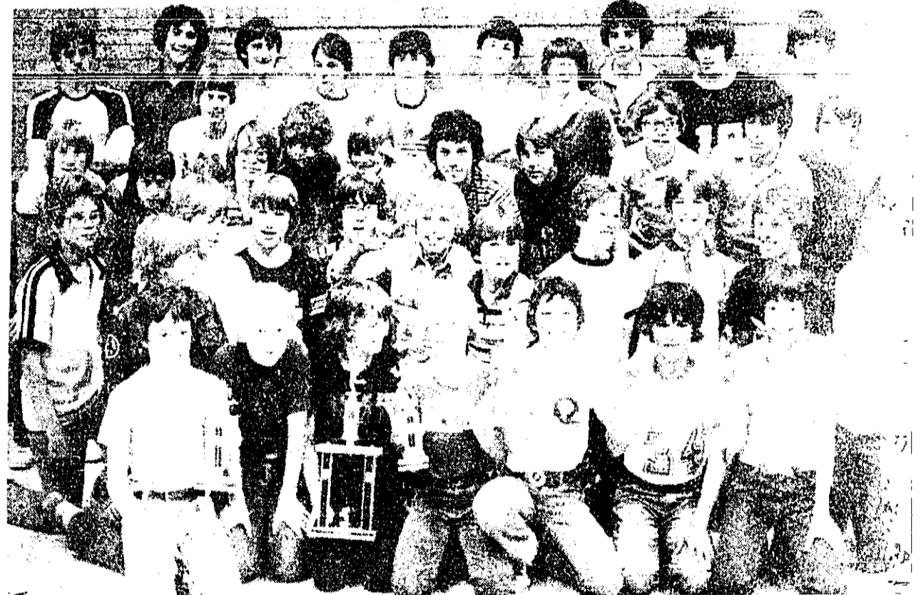
UNDEFEATED BOYS -- The Cass City Intermediate boys' track team went undefeated in both league and tournament competition this year, posting a 4-0 league record and a 3-0 tournament record. Two school records were set by the team.

The important rainout game against Bad Axe will be played June 2 at 4:30 p.m.