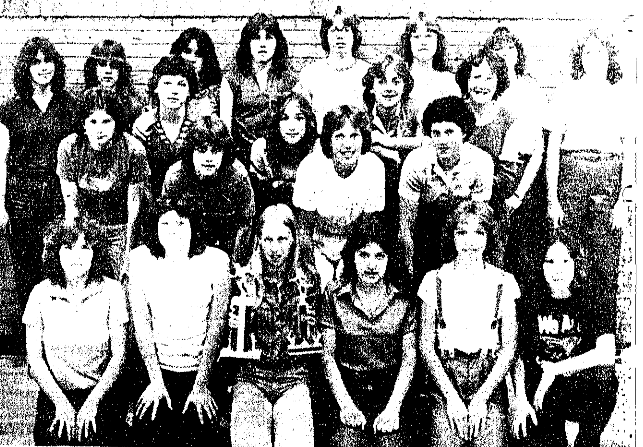
UNDEFEATED GIRLS -- Gathering for a team photo is the undefeated 1980 Cass City Intermediate girls' track team. The girls earned their trophies by completing a 7-0 record this year. Members of this year's team broke seven school records.