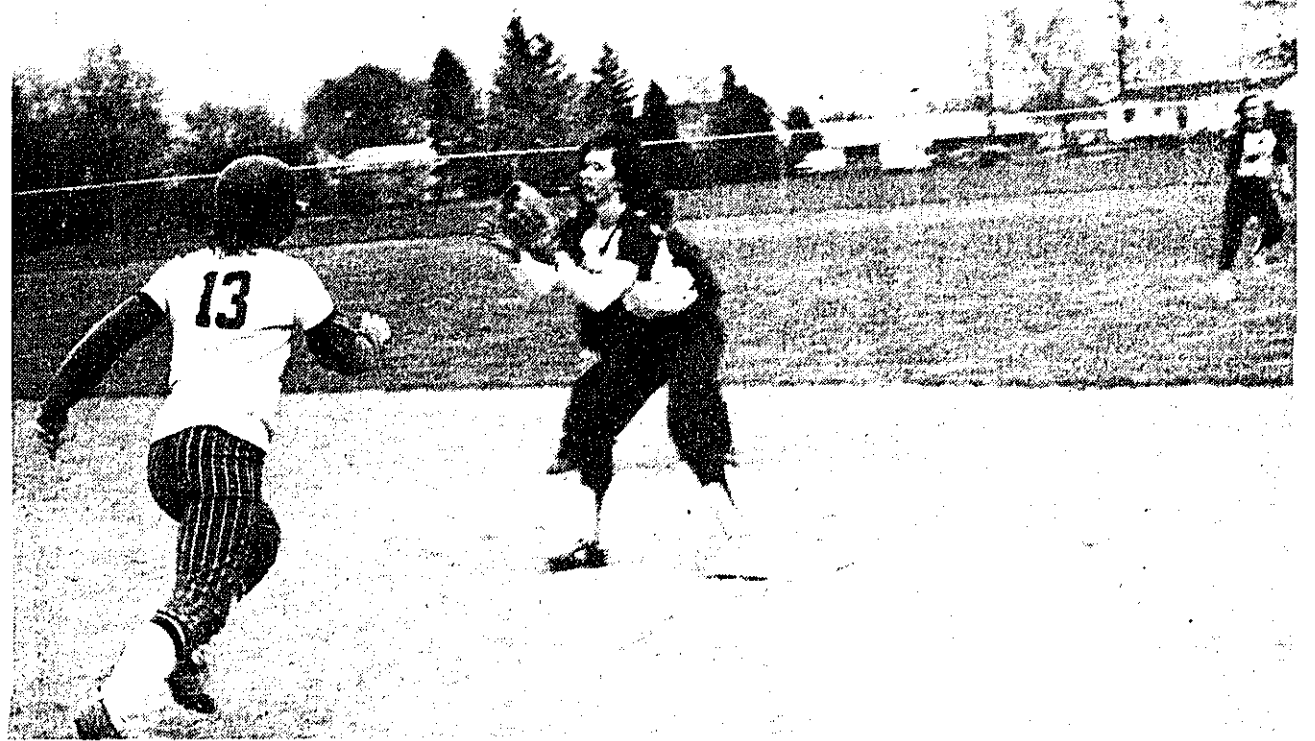
GOOD DEFENSE helped to nail the runner on this play and defense has sparked the Cass City Red Hawk softball team to an undefeated record in the Thumb B Association this year.