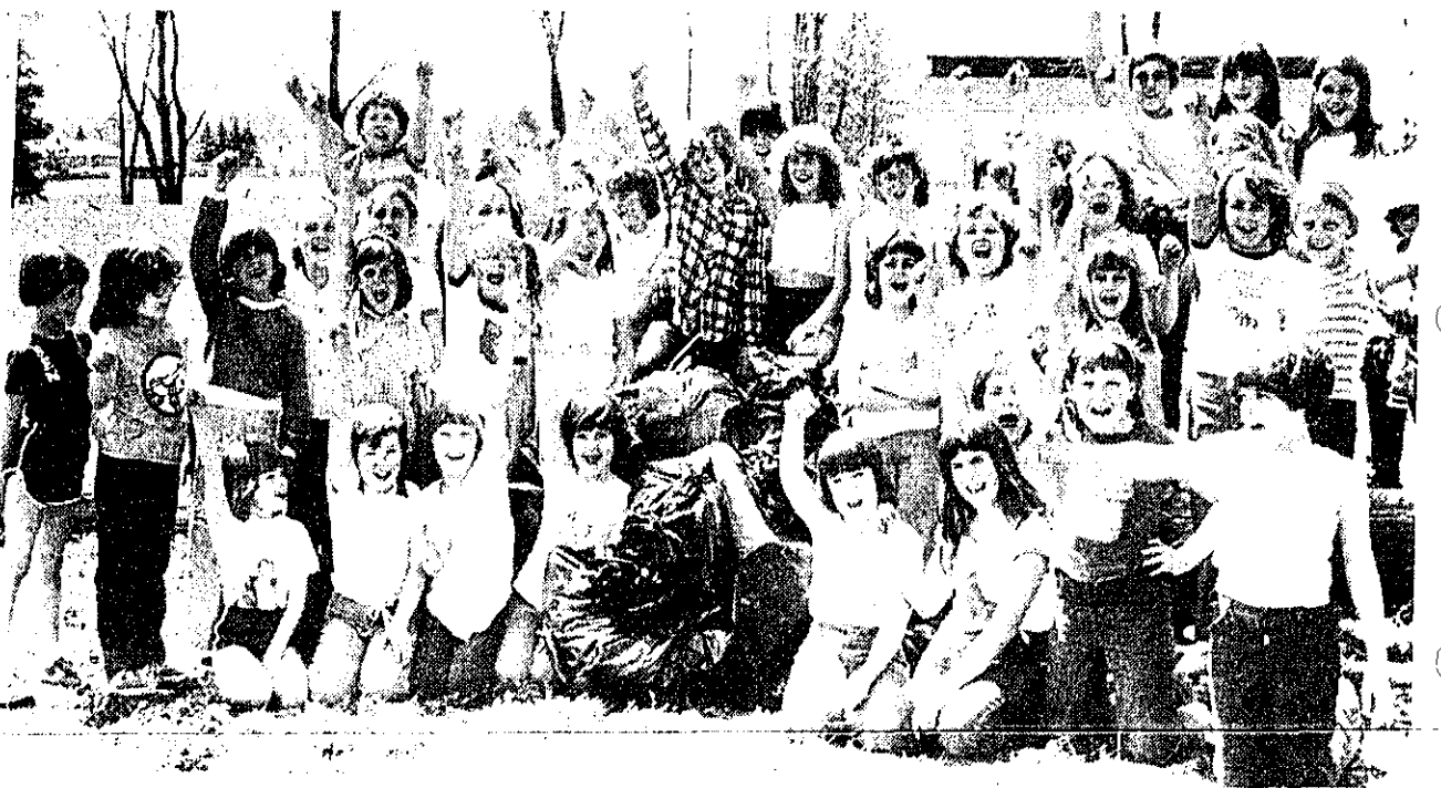
CLEAN-UP -- Cass City Girl Scouts surround the bags of trash they accumulated in cleaning up the village park Saturday afternoon.