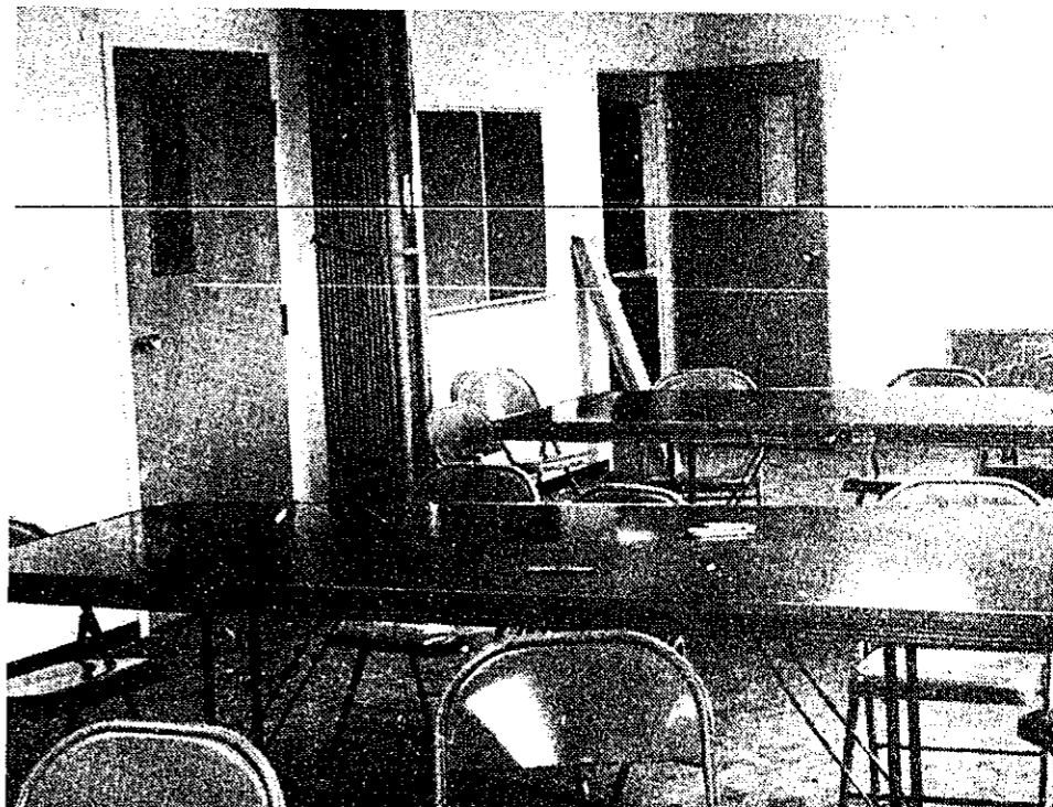
CLASSROOM -- A partial view of one of the new classrooms at the church. The divider and another one out of view can split this room into three smaller ones. Each small classroom will have its own blackboard-bulletin board and storage cabinet.