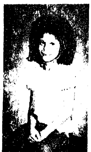
Cantina, 8, daughter of Mary Heaton, 4721 South Street, Gagetown.