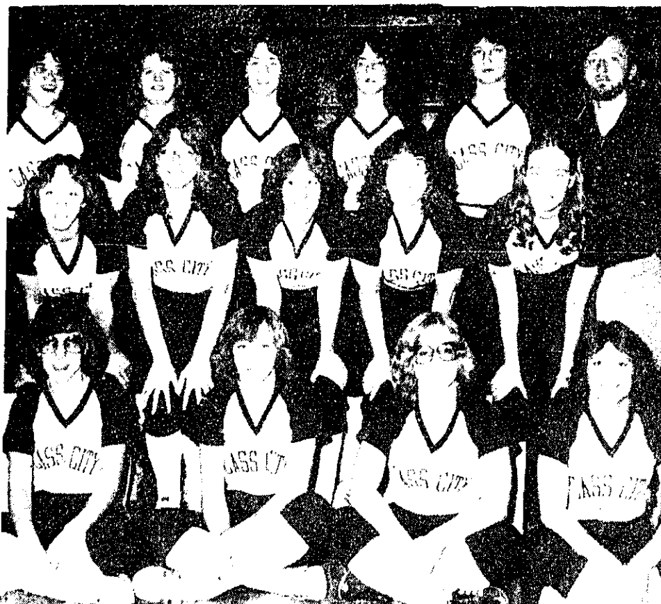
THERE IS A STRONG defense and some lusty hitting on the Cass City 1980 softball team this spring. Cass City is expected to be a challenger for the league title if the girls perform to potential.