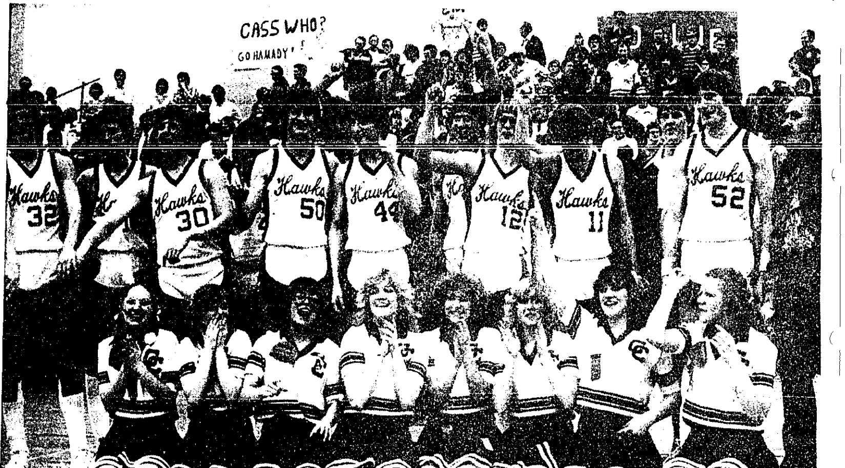
AFTER IT WAS OVER the Hawks lined up for a picture, still elated with their narrow win.