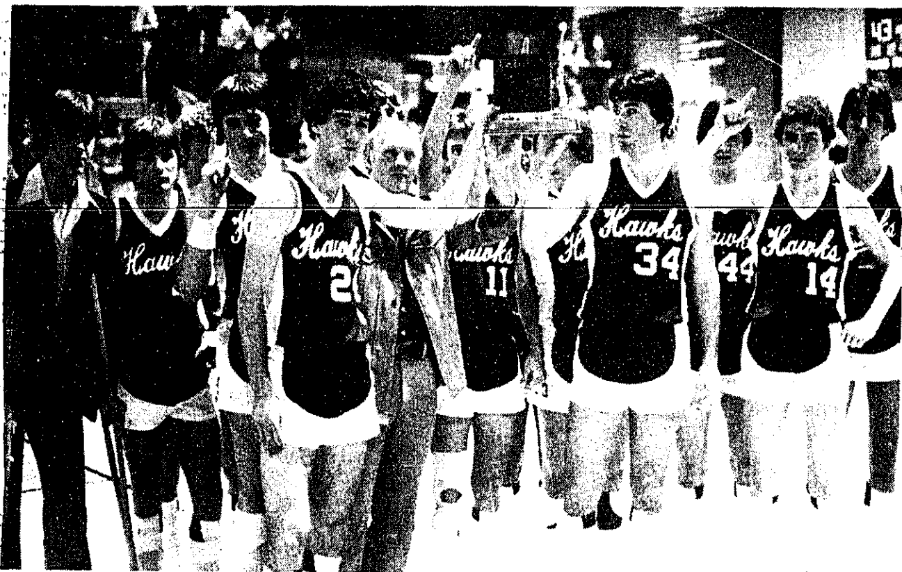
DISTRICT TITLISTS Cass City Red Hawks pose for a championship picture after defeating Sandusky in the district finals. The Hawks were tested by the Redskins before winning.