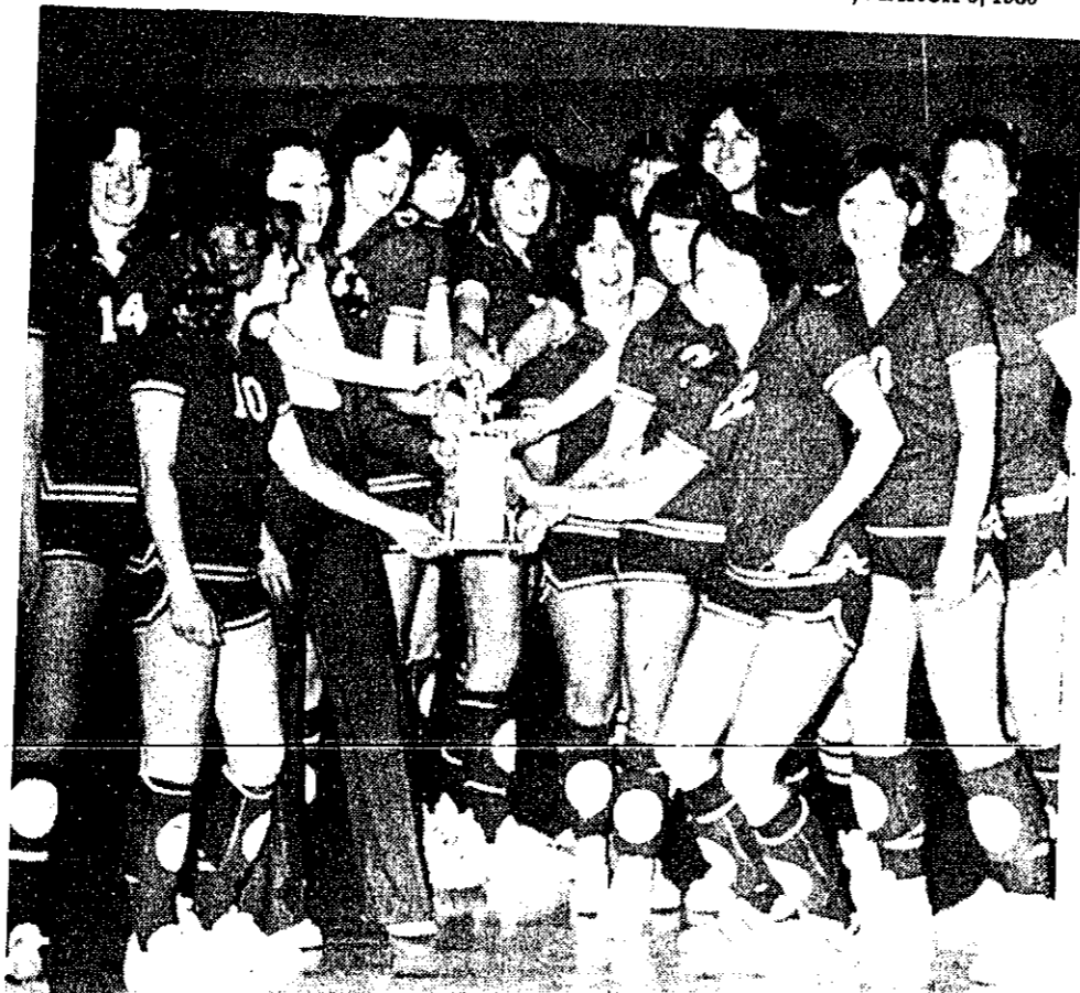
DISTRICT CHAMPS -- Owen-Gage girls were the happy recipients of the trophy Saturday after winning the district volleyball title in their own gym by defeating Akron-Fairgrove in the final match.

Life is a succession of lessons - they can be understood only by living through them.