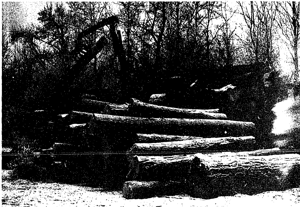
THIS BIG PILE of lumber was harvested near Snover by Steve Papp and trucked to the banks of the Cass River on River Road where it was picked up by representatives of a saw mill. Papp says that the lumbering business is becoming harder each year. One reason is that the grades of lumber produced here compete with use as firewood. As the price for the trees as fuel increases it becomes harder to buy a woodlot, and cut it and still show a profit, Papp says.