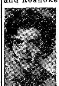
Miss Chapman about 650 miles.