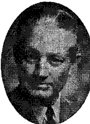
Re-elect KIM SIGLER Governor