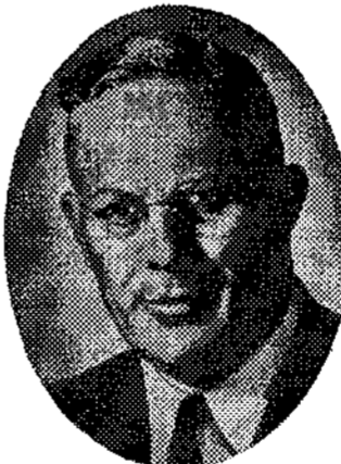
Elect EARL WARREN Vice President