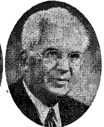
Re-elect HOMER FERGUSON U. S. Senator