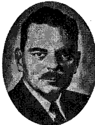
Elect THOMAS E. DEWEY President