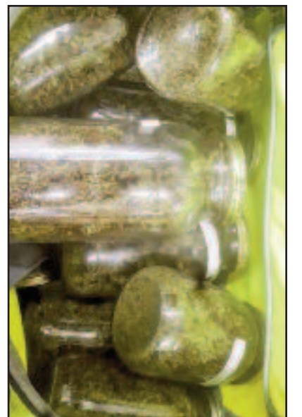
A PORTION of the 25 pounds of marijuana seized by police is pictured above.