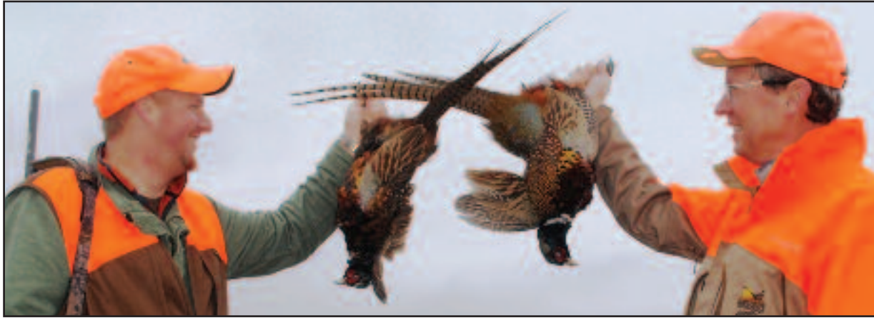
MYERS (left) and Bill Vander Zouwen, Michigan Region representative for Pheasants Forever, display a couple ring-necked pheasants they shot.