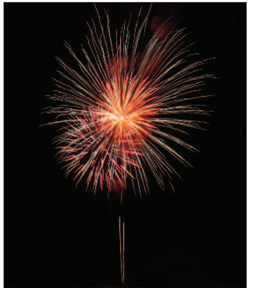
FIREWORKS EXPLODED in the sky over Cass City during last year's Freedom Festival to close out the weekend of patriotic celebration.