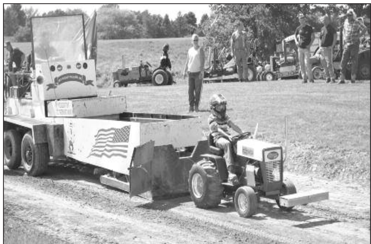
THE CROWD GATHERS to watch MT Pocket Pullers during last year's Freedom Festival celebration.