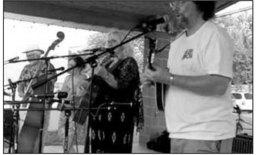
THE BAND MUZYKA! a Tri-City bluegrass, folk, pop and gospel group will perform at the Cass City Rotary Park Friday, July 3 from 6:30 to 7:30 p.m.

Music in Rotary Park will continue throughout the summer, with live music provided each Thursday night at 6:30 p.m. through Friday, Aug. 14. For a schedule of the performers, see the bulletin board at Rotary Park on Main Street.