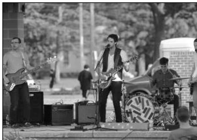
LAST YEAR, Music in Rotary Park featured a variety of bands, and this year will be no different. The Fulchers, a local band that performs a variety of music, will perform on Friday during the Freedom Festival and Sunday will feature inspirational and patriotic music from area churches and musicians.

Sorenson said the summer concert series began June 27 and will run every Friday night at Rotary Park through Aug. 22 — except Aug. 1, when the park will be used for Summer Mania.