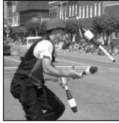
A TALENTED JUGGLER was among those who joined the ranks of last year's successful Freedom Festival Grand Parade in Cass City Saturday morning.

For more information about the parade, or entry forms, visit the Freedom Festival's website at www.ccfreedomfest.org .