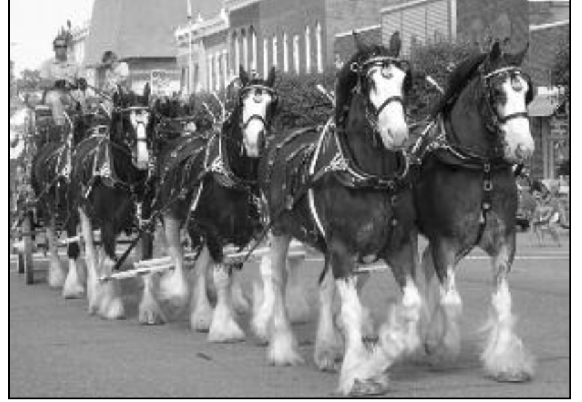
A TEAM of Clydesdales was a crowd favorite during last year's Freedom Festival parade.