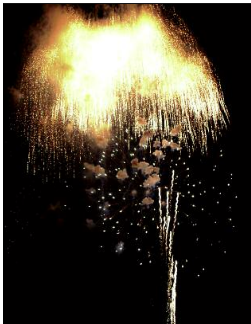
FIREWORKS EXPLODED in the sky over Cass City during last year's Freedom Festival to close out the weekend of patriotic celebration.

The Cass City Lions Club and Cass City Gavel Club always help out with the event, according to Lowman, who said the golf course always tries to give back to their organizations.