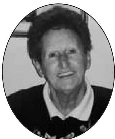
2014 at Bay Medical in Bay City.