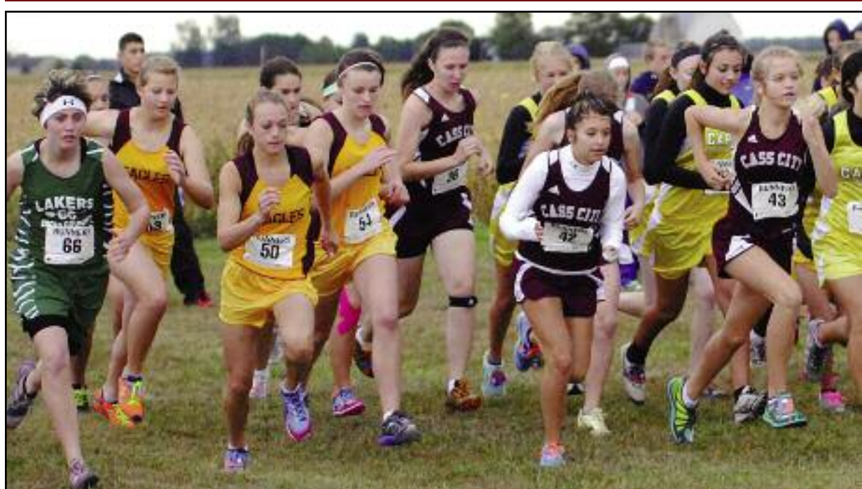
THEY'RE OFF. Approximately 35 lady competitors from 5 schools vie for top honors Saturday at the Elkton-Pigeon-Bay Port Invitational.