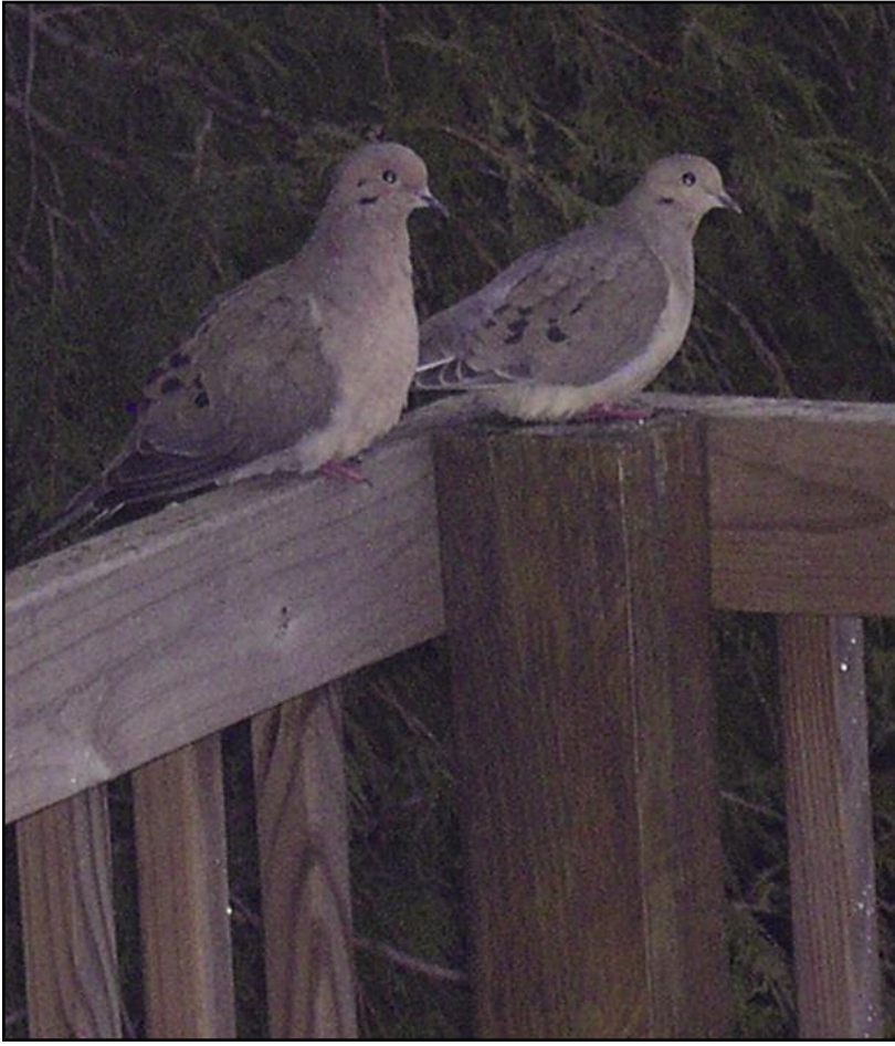
BIRDS OF A feather — A pair of mourning doves enjoy Sunday's mild temperatures while perched on a deck railing at a Cass City area residence.