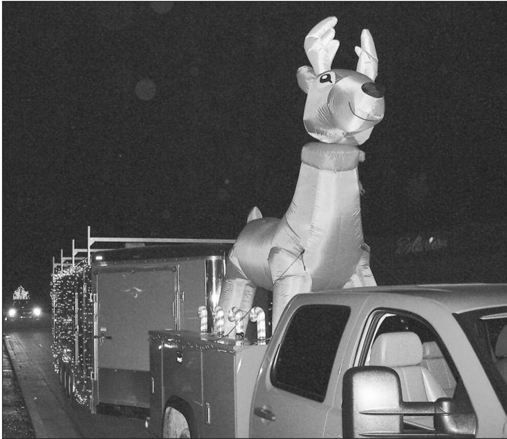
AT LEAST ONE of Santa's reindeer made an appearance during the Lighted Christmas Parade in Cass City Saturday night. His transportation was provided courtesy of d/s Services, Cass City.

VFW HALL, renovated 2012, weddings, parties, funeral dinners. 989-872-4933. 4-2-22-ff