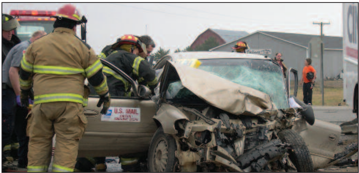
A TRAFFIC CRASH closed a portion of M-81 at Cedar Run Road Monday afternoon. Details were not available at press time, but the accident appeared to have involved multiple injuries and at least 3 vehicles – 2 passenger cars, including one driven by a U.S. Mail carrier, and a panel truck. Cass City police, Tuscola County Sheriff’s deputies, Elkland Township fire fighters and MMR ambulance crews were all dispatched to the scene.

— in fact, they need not follow the Please turn to page 7.