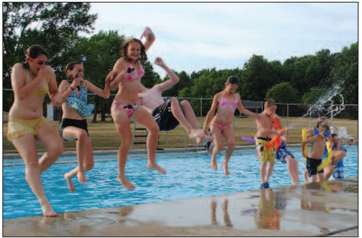
GETTING WILD and wet were a group of kids who had participated in the Relay for Life's Swim-A-Thon, which was held at the Cass City Pool last Friday. The children participated in the overnight event, which took place from 7 p.m. until 7 a.m. the following morning.