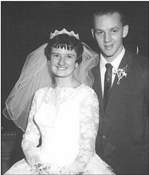
Romains in 1961