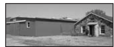
and 60 x 70' Commercial pole building

REAL ESTATE 3651 Sixth St, Cass City Stone 2 bedroom, 1,000 sq. ft. house/office w/half bath & fenced in lot