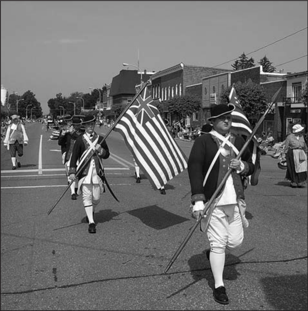
THE GRAND PARADE was a crowd favorite, as always, during the annual Cass City Freedom Festival over the weekend.