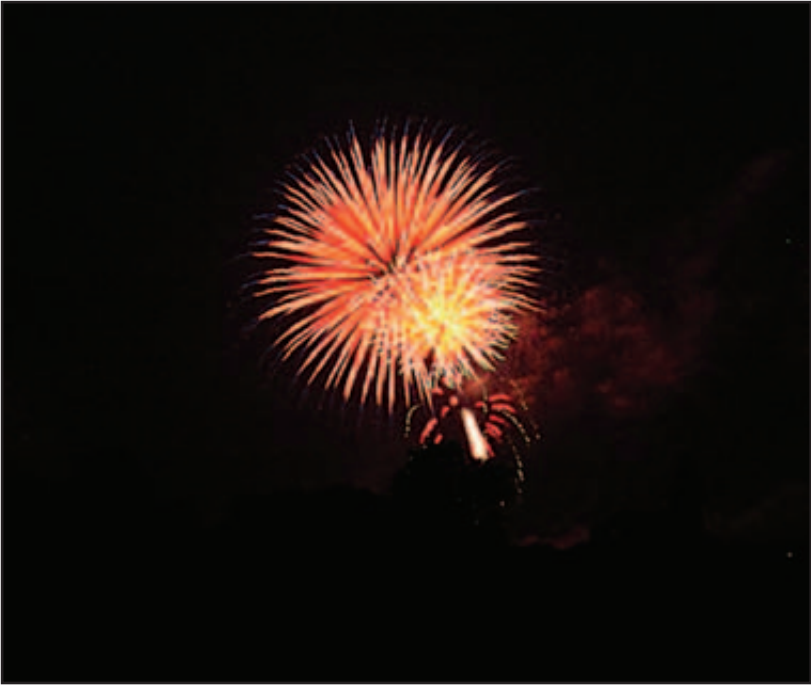
AN IMPRESSIVE fireworks display marked the end of another great Cass City Freedom Festival Saturday night.