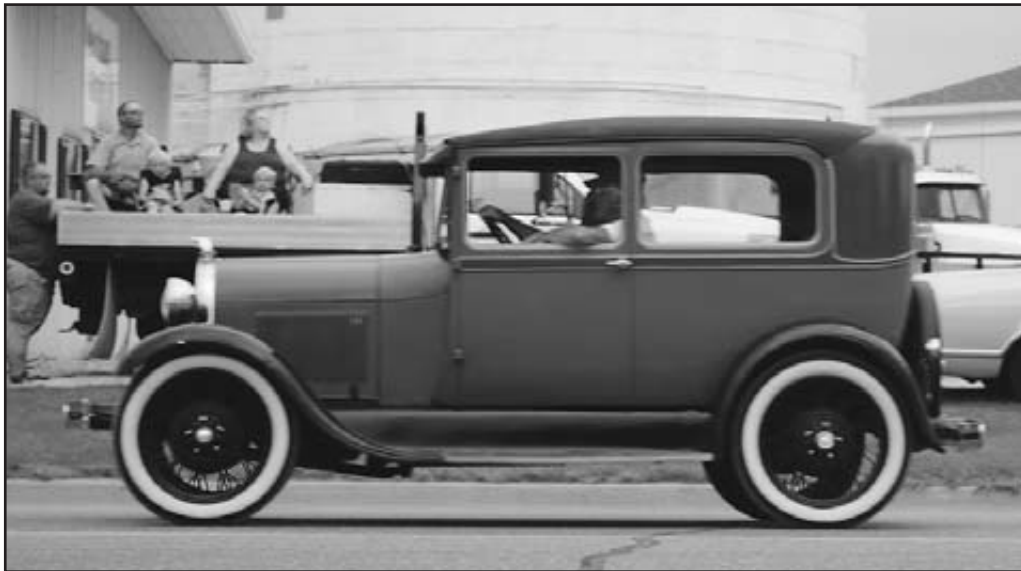
CLASSIC CARS cruised by during the Fourth of July Freedom Festival in Cass City.