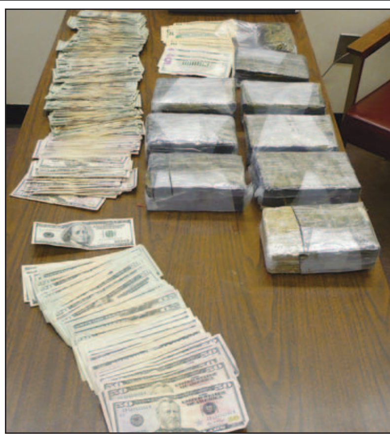
HURON COUNTY authorities seized 10 pounds of marijuana and some $12,000 in cash while executing separate search warrants in the villages of Elkton and Owendale last week.