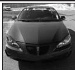
2008 Pontiac Grand Prix

2008 Pontiac Grand Prix (red) Certified/Preferred 32,164 miles...$14,450