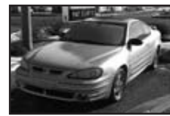
2003 Grand Am

2009 Chrysler Town & Country (blue) Pre-Owned 28,791 miles...$19,550