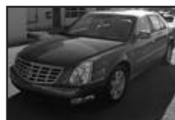
2006 Cadillac DTS

2004 Chevrolet TrailBlazer (green) Pre-Owned 174,662 miles...$7,995