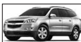
2009 Chevrolet Traverse

2009 Chevrolet Traverse (red) Certified/Preferred 39,984 miles...$26,950