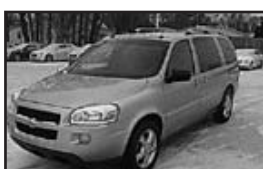
2005 Chevrolet Uplander

2006 Cadillac STS (silver) Pre-Owned 69,003 miles...$21,595