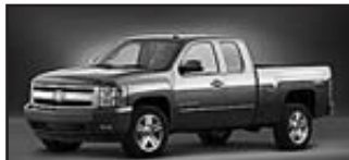
2007 Chevrolet Silverado 1500

2007 Chevrolet Silverado 1500 (white) Certified/Preferred 51,793 miles...$22,700