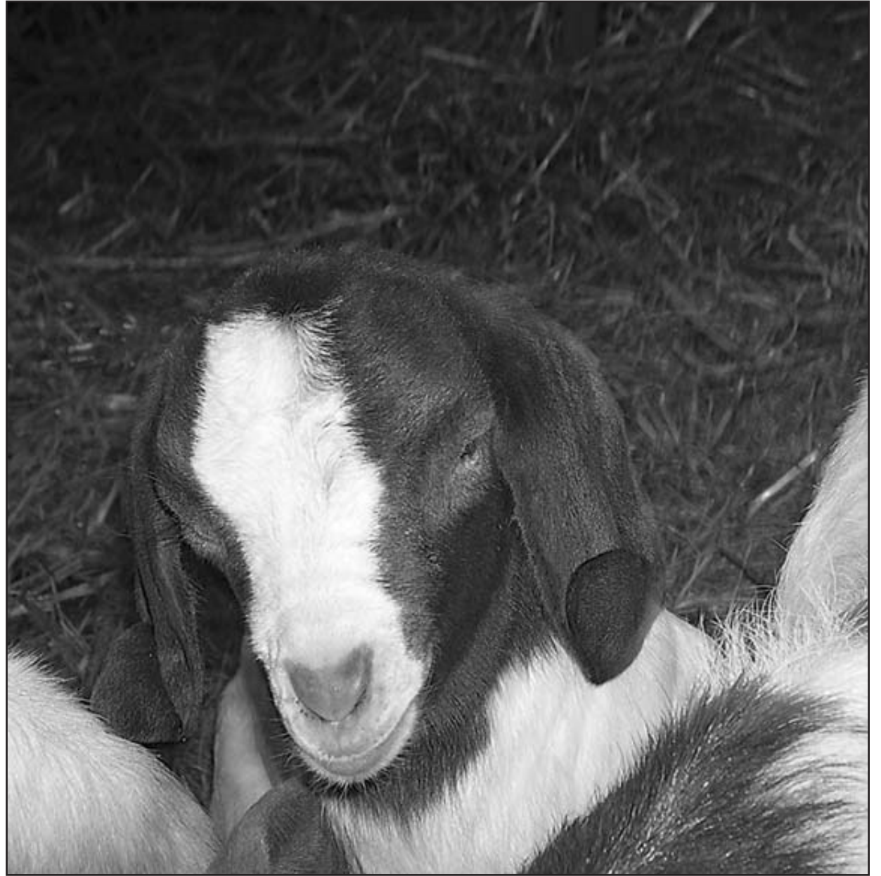
ASHLEE GIBSON'S agriscience students are caring for 2 newborn goats as part of their studies at Cass City High School. (Related photo, page 1)

Trucking companies located in New Jersey and Canada can obtain information by calling (517) 373-6256.