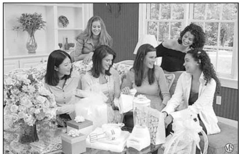
Following a few wedding registry tips will help relieve some of the stress associated with wedding planning.