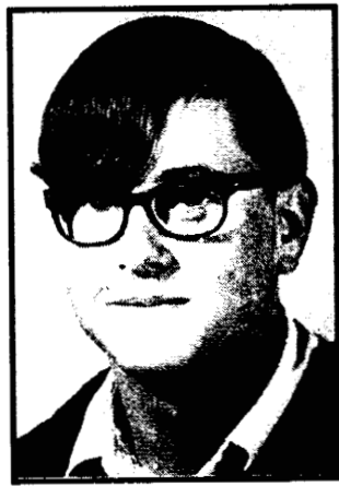
You bald-headed Polack!