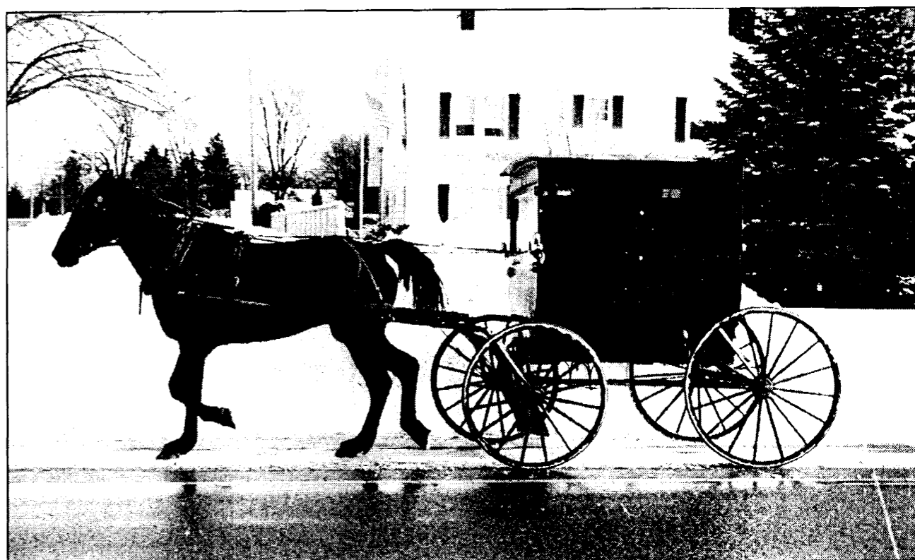
The old fashioned way...

The sights will include the Australian Zoo, home of Crocodile Hunter Steve Irwin, as well as the Sydney Please turn to back page.