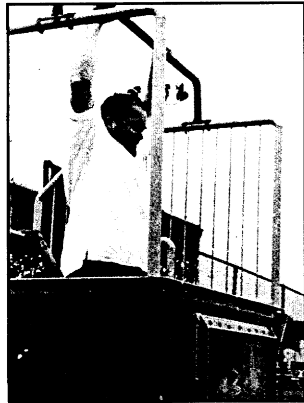
DUNK TANK returns. Popular and profitable for Festival.

With that help, the festival had $1,893.31 in a contingency fund starting the year.