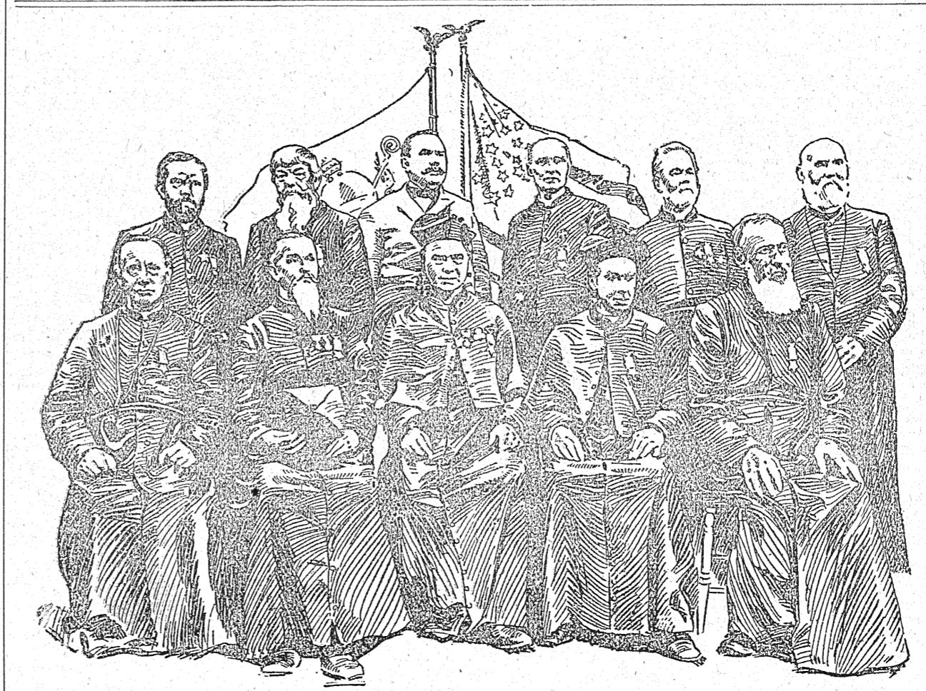
G. A. R. POST NO. 569, MUSTERED IN OCT. 5, 1897. (The Attention of the Entire Country Has Been Attracted by the Peculiar Interest Attaching to Its Organization.)

Life without liberty is joyless, but life without joy may be great. The greatness of life is sacrifice.—Ouida.