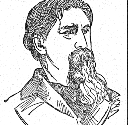
DANIEL W. VOORHEES. THE INDIANA DEMOCRAT'S LIGHTNING RODS ARE UP.