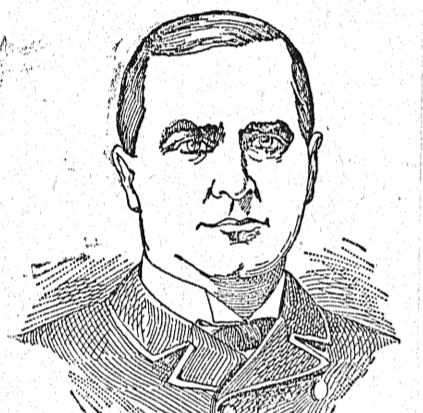
GOV. WILLIAM MCKINLEY. REPUBLICANS ARE LOOKING HOPEFULLY TO OHIO'S FAVORITE SON.

A Surprise Wedding. The newest idea in society is the "surprise" wedding. Invitations are sent out for a dinner party and when the dinner is over the parson is introduced in "a few well chosen words," the bridegroom takes the guests into his confidence the bride blushingly takes her place and the marriage is solemnized without further ceremony.