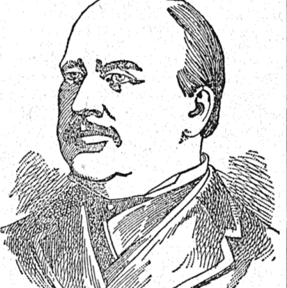
THOMAS B. REED. THE MAN FROM MAINE WHO IS IN THE RACE.